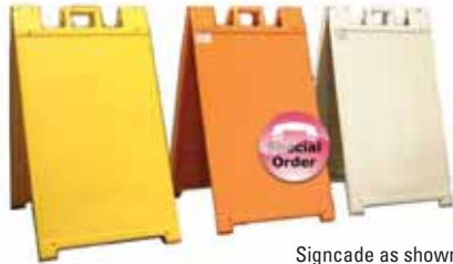
Squarecade (orange is special order only) Signcade as shown