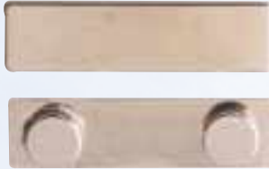
MP305 - Set Small Power Mag

Eliminate holes in clothing. All Magnetic Badge Attachments are self-adhesive.