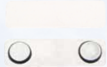
MP302 - Set Large Power Mag - 2 Post