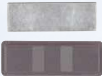
KH500 - Set