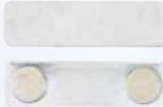
MP300 - Set Magna Power