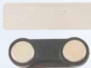
MP311 - Set Small Plastic Covered