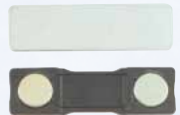
MP321 - Set Large Plastic Covered

See page 79 for Badge Blanks and Frames.